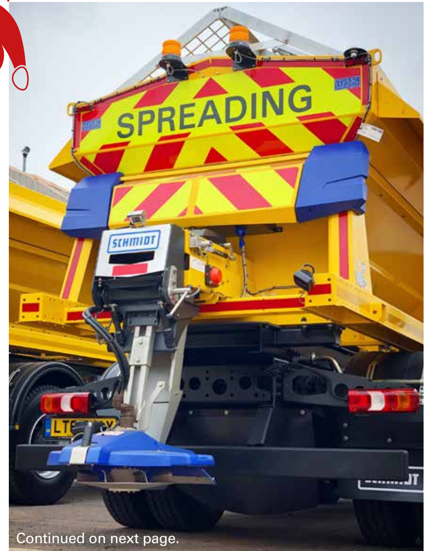
Continued on next page.

The new winter fleet, which can treat Sandwell's roads with more than 55 tonnes